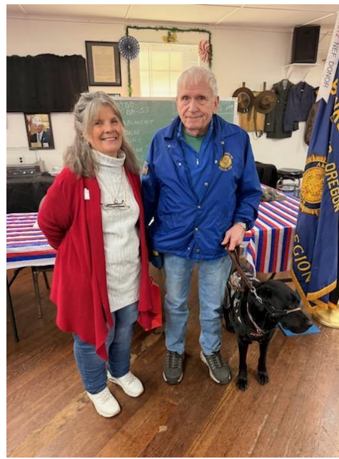
President’s Project Recipient