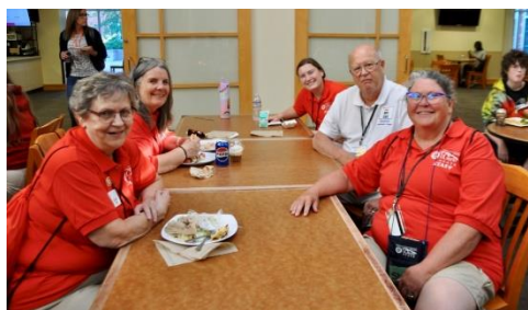
Our Volunteers to the left Thank you, Ladies!!!

This year we had a total of 31 Citizens Attend our Girls State program and 6 Volunteers.