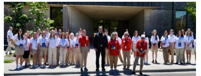
All the Girls State Citizens and Staff together on the right.