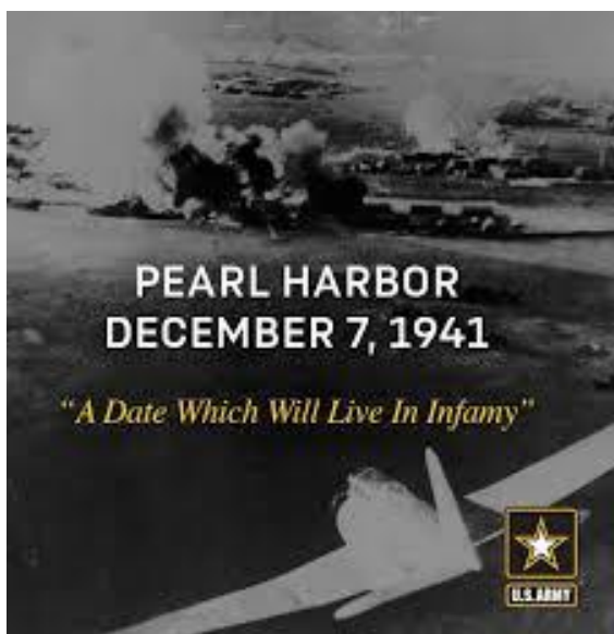
Pearl Harbor 1941

On Dec.7,1941, the Japanese military made a surprise attack on the United States Naval Base at Pearl Harbor in Hawaii, which resulted in the deaths of thousands of service members and civilians, over a thousand injuries, the sinking of American ships and destruction of aircrafts. The next day, the U.S. declared war on Japan and entered into World War II.