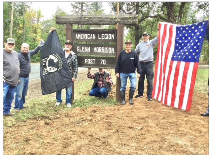
The Post 70 Flag Pole was recently removed, so the guys took a moment to show the Flags!