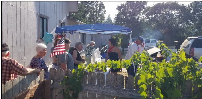
Folks lined up for the great BBQ food!