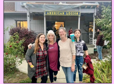
The Post served as a good gathering place for the event.