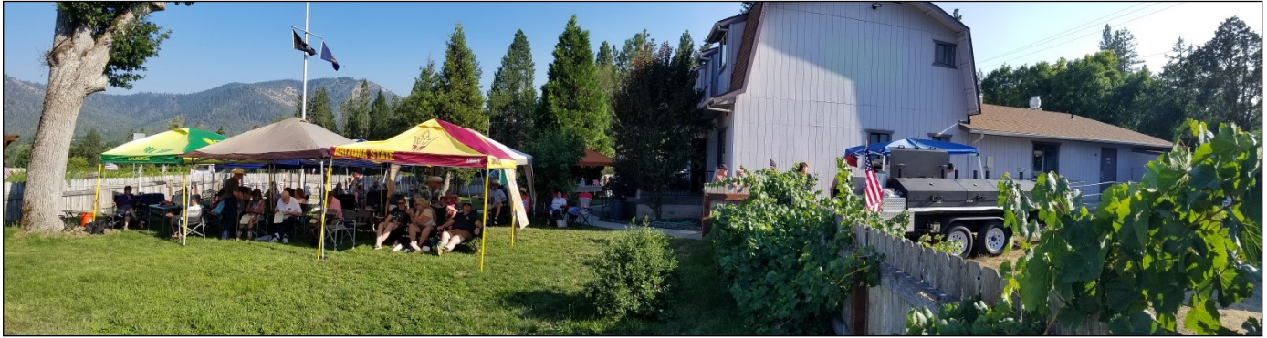
While hot and little smoky, it was still a beautiful day!