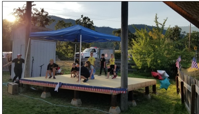
A number of local kids took part in the A-Rae of Light Dance Studio performances.