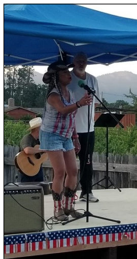
Special Guest, Actor and Entertainer Malinda Buckles, performed several patriotic songs from the last century for the crowd!