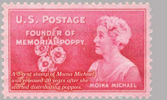
A 3-cent stamp of Moina Michael was released 30 years after she started distributing poppies.