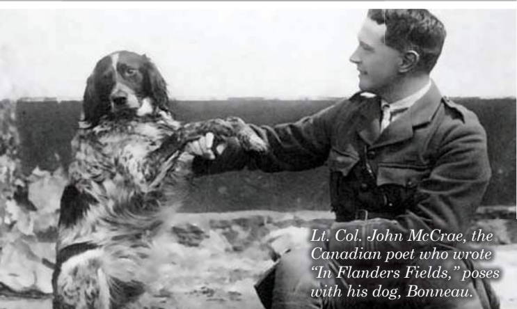
Lt. Col. John McCrae, the Canadian poet who wrote "In Flanders Fields," poses with his dog, Bonneau.